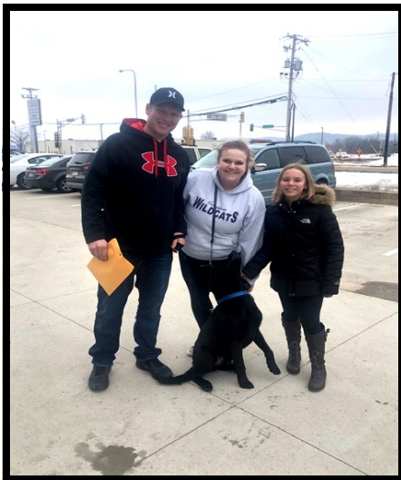
Mack was taken in and cared for by a HAHS foster home after being found by police and placed in the dog pound. Mack is shown here with his new owners.