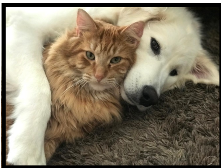
Charlie (cat) was adopted from HAHS by the Wells family in Minneapolis. Shown here with Charlie is Luna (adopted from another humane society), Charlie's BFF.