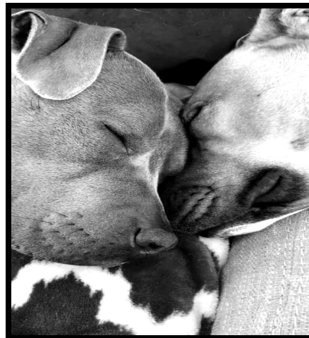
Saige (on left) was abandoned and taken in by HAHS. Her new forever family sent us this photo to show how she has bonded with her new "sister". Thank you for sending us this photo.

Hiawatha Animal Humane Society came into existence almost a half century ago. The effect of each year's work has built upon the next and has added up to something quite profound. We see new members joining and we continue to grow. We remain busy doing what needs to be done to help animals in need. We are grateful for the support from people who help with fundraisers, those who adopt, the fosters who open their homes and care for animals until new homes are found and for all the donations of food/supplies/money. Thank you for your time, talents, ideas and resources.