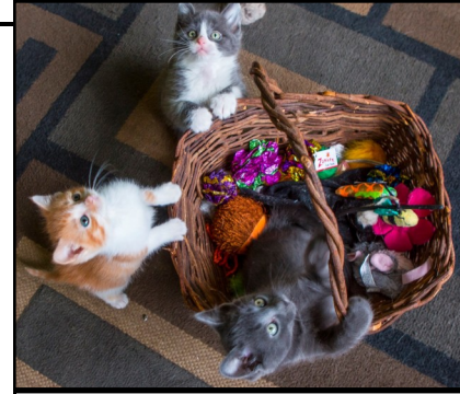
FOSTER CATS AWAITING ADOPTION AT THE BALDWIN FOSTER HOME.